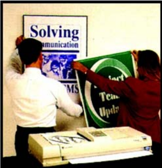
Displaying goals, recognition and suggestions helps to improve communication and boost morale.

Kaizen begins when the worker adopts a positive attitude toward changing and improving the way he works. Each suggestion leads to a revised standard, and since the new standard has been set by a workers own volition, he takes pride in the new standard and is willing to follow it.